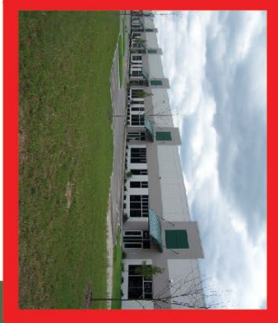
Photo - Existing Signage Harrison Commerce Center