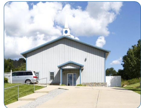
• 4,000 SF Church Building